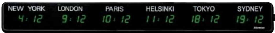
WorldStyle 6 cities

Display: hour minute Choice of city text Local times programmed in factory and modifiable on site. Automatic time changeover.